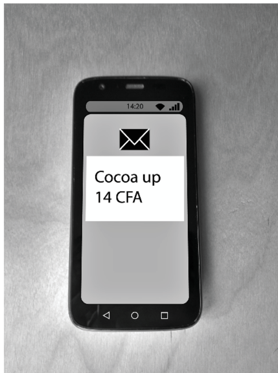
Figure 1: An example of a text message