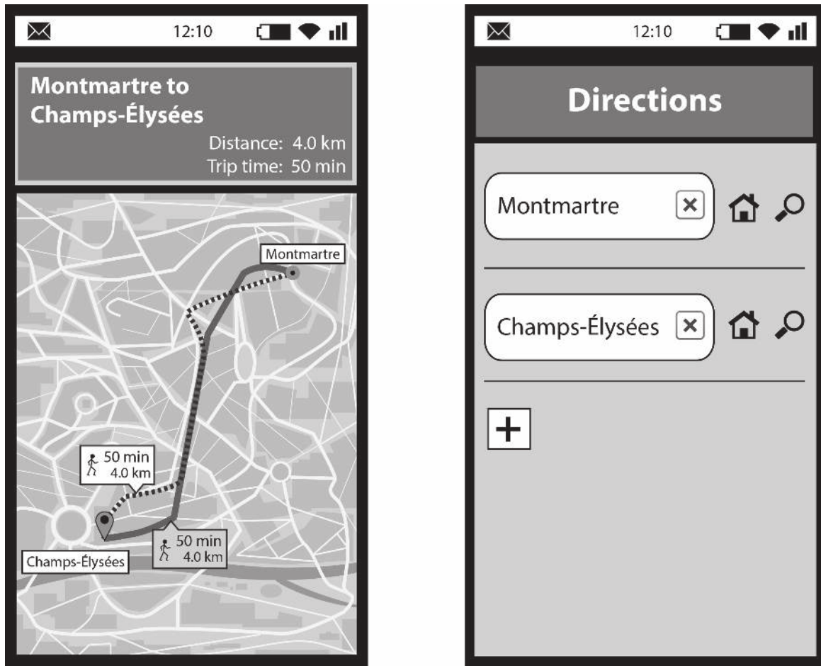
Figure 3: An example of a route suggested by SVP