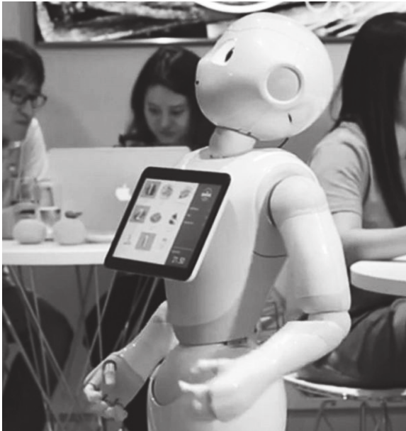
Figure 4: Dennis, the restaurant robot